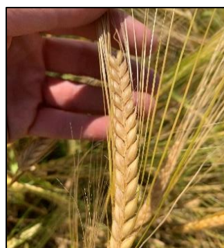
HudsonNY barley at Chatham