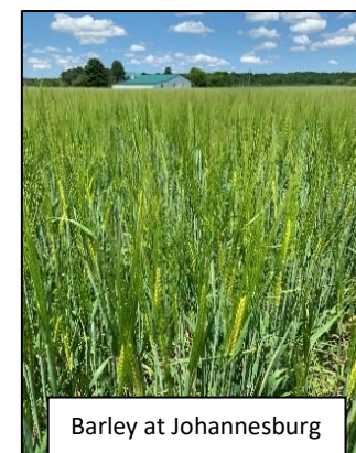
Barley at Johannesburg