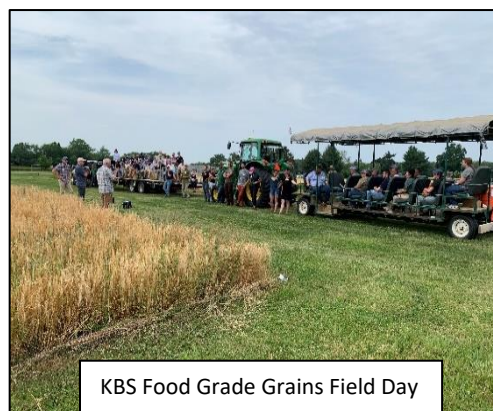
KBS Food Grade Grains Field Day