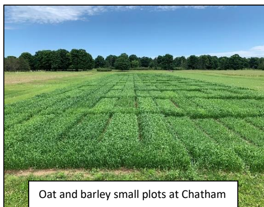
Oat and barley small plots at Chatham